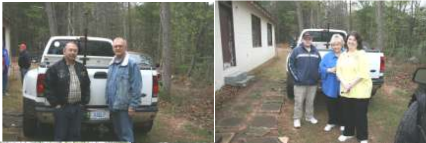
4th & 5th