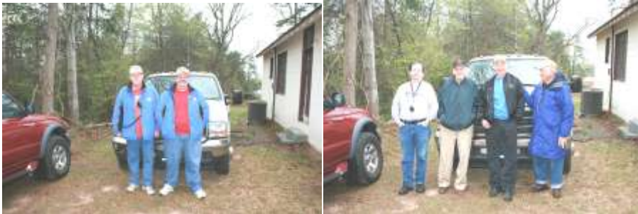
1st & 2nd 3rd, no picture