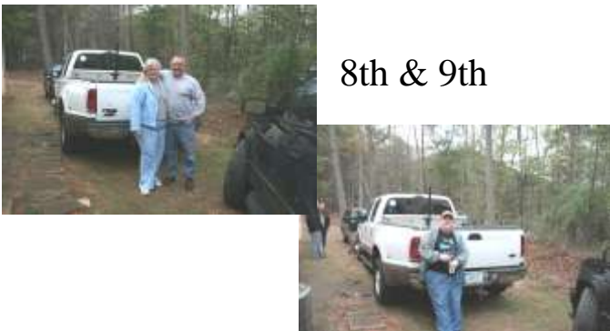
8th & 9th

We now have 19 members who are NIMS certified on the state database. These 17 may be sent to ANY disaster per FEMA regulations.